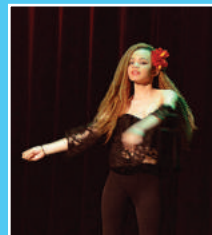
Tanaja performing at Showboat 2015

FM Step Team performs at Eagle Hill Middle School January 14 at 2:30. This event will kick off a school-wide fundraiser for FM-ABC!