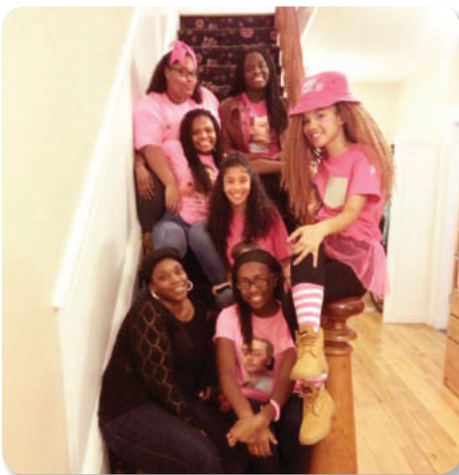
The ABC house got "Pinked Out" for a FMHS football game, in honor of breast cancer awareness month