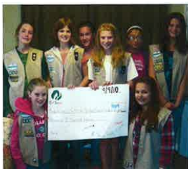
Girl Scout Troop 845