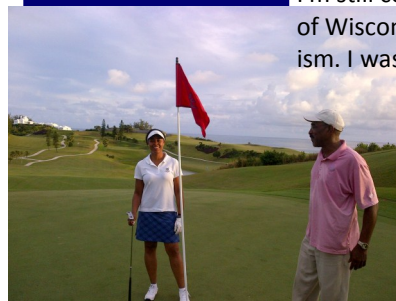
Barbara Eden enjoying golf!

I'm still covering entertainment for CNN/HLN, and I am currently on the Board of Visitors for the University of Wisconsin School of Journalism and Mass Communications, where I went for graduate school in Journalism. I was invited to join the board last year.