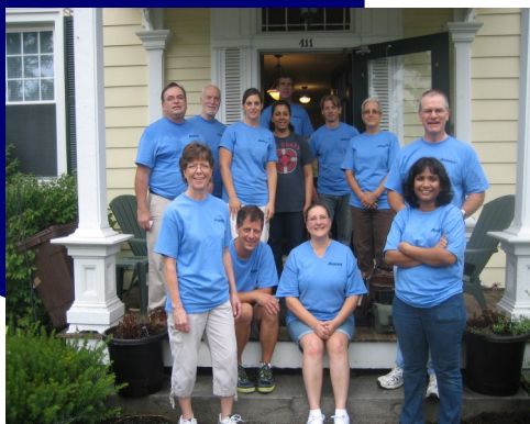
Anaren Service Volunteers

Thanks to our Corporate Community Friends who devote Community Service Days to make our house shine. Your help is greatly appreciated!